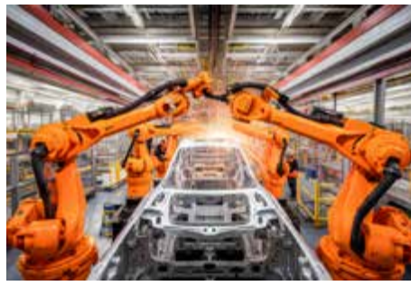
04 UK's Pioneering Legislation: Zero Emission Vehicles by 2035