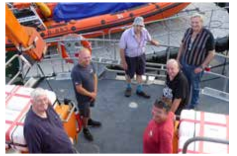
07 IRTE Cornwall Centre Brave the Waves at Newlyn Lifeboat Station