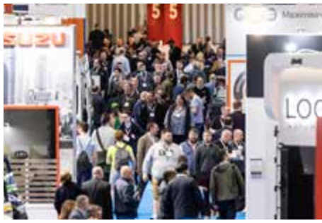
03 Shifting Gears: CV Show 2024 Puts People in the Driver's Seat