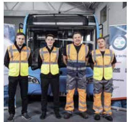
Excel Technical Resourcing